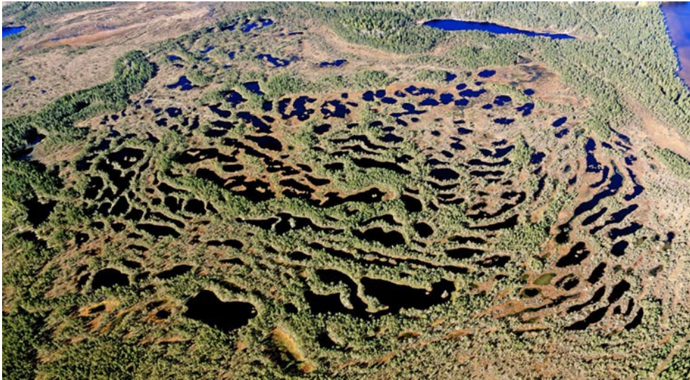
Knuthöjdsmossen. Photo: Bergslagsbild AB

The hundreds of pools make Knuthöjdsmossen a paradise for a multitude of insects and birds. The Red-throated Diver has become a big celebrity of Knuthöjdsmossen, but it is easily disturbed. During the period 1 April to 1 September, it is forbidden to leave the trail in the main part of the reserve, or enter the path north of points A and B on the map.